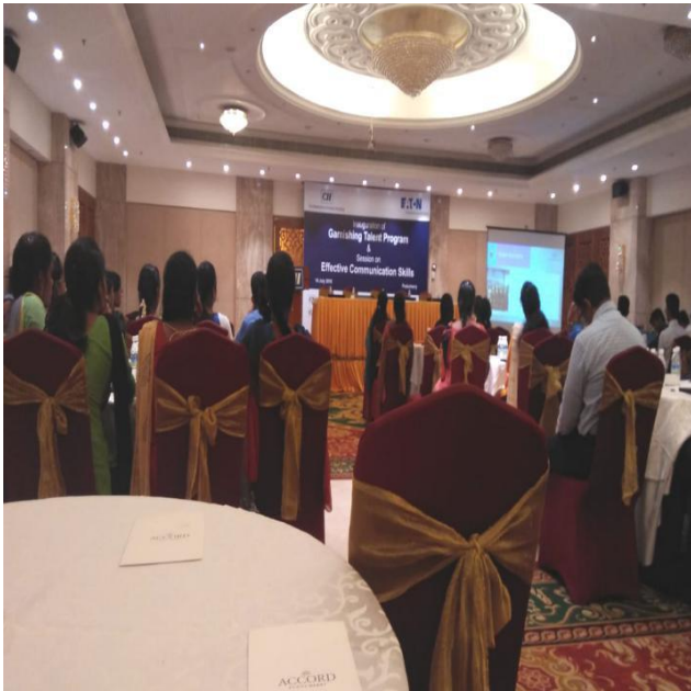
Technical Session – GTP at Hotel Accord