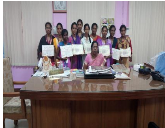
ED Cell members with the Principal