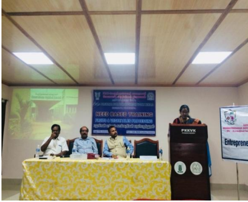
Presenting Training Report