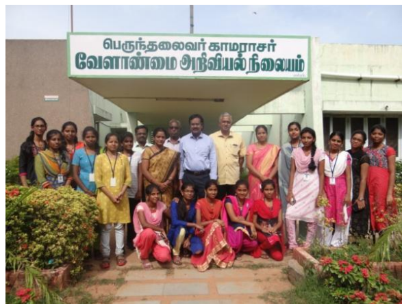
Active Team Members