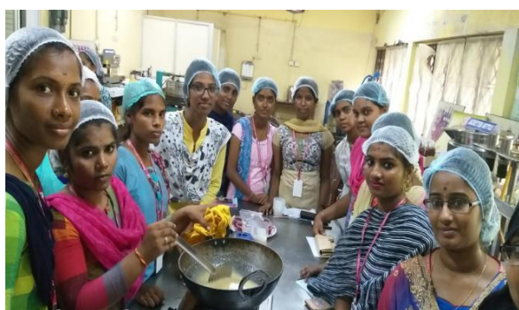
Active participation in the training programme