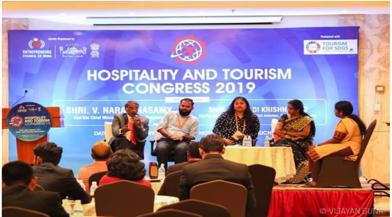
Panel Discussion on Hospitality and Tourism