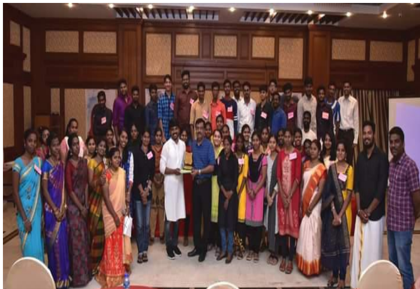
Workshop participants with Chief guest