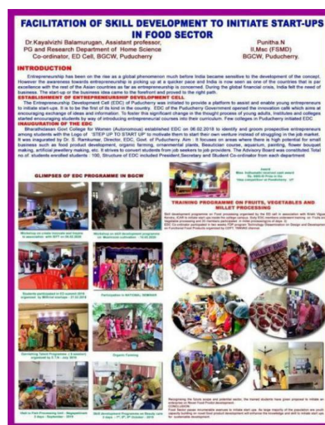
Poster presented in the Seminar