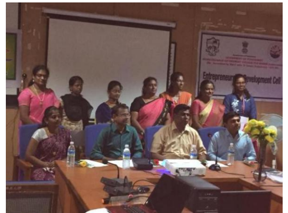
ED Cell Members, Principal and Chief Guest