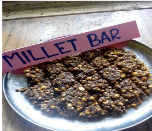
Demonstration of Product development