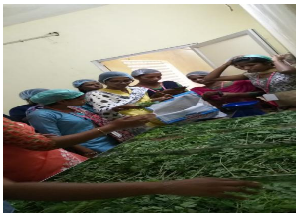
Moringa leaf processing using tray dryer