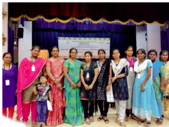
Participation in National Seminar on Facilitation of Skill Development and Start-ups in Food Sector