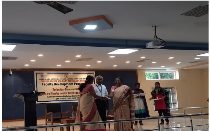
Receiving certificate from Dean, College of Food and Dairy Technology, TANUVAS, Chennai