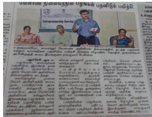
News Paper Clipping