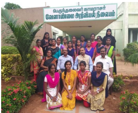
Participants with the Chief Guests