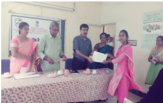
Participant receiving Certificate