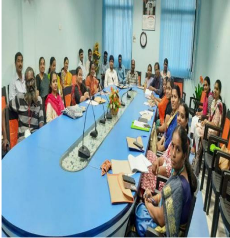
Participants in the FDP