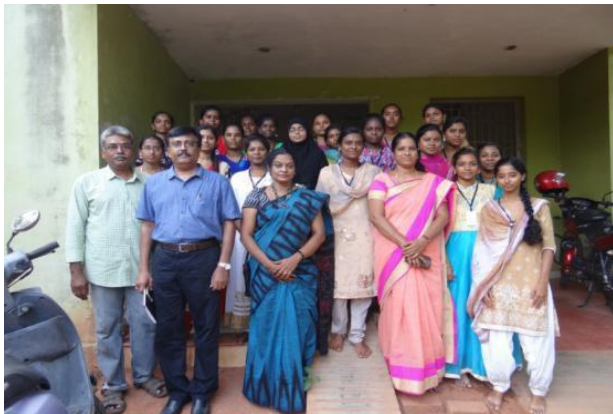
Participants with the Chief guest