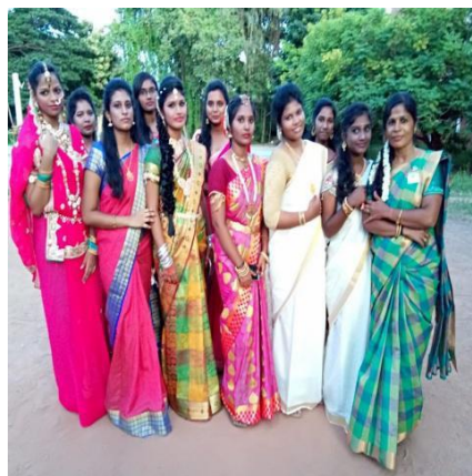
Face Make up and Saree Draping