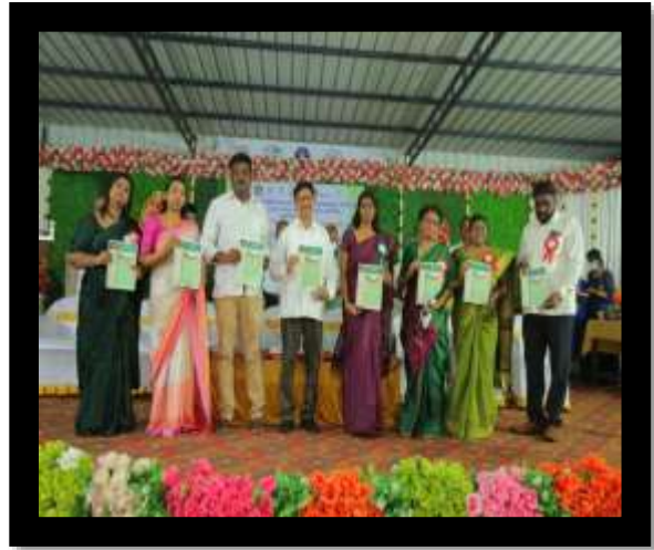
Release of "ECOVIRON" Newsletter