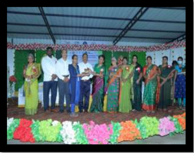
Prize distribution to the winners