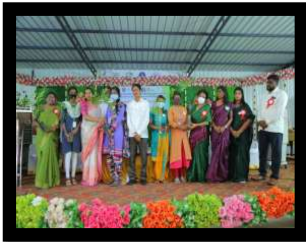
Presenting Saplings to the Students