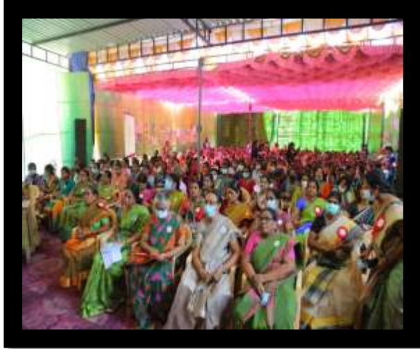
Faculty and Students at the event