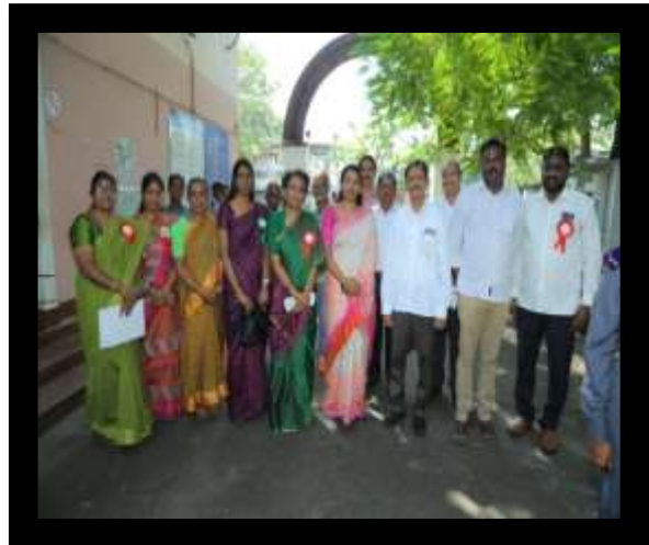
Honouring of Bharatiyar Statue and arrival of Guests and Dignitaries