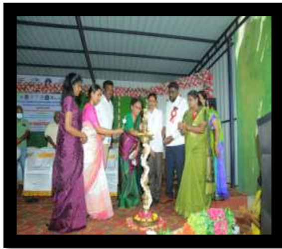
Lighting of Kuthuvellaku by the Dignitaries.