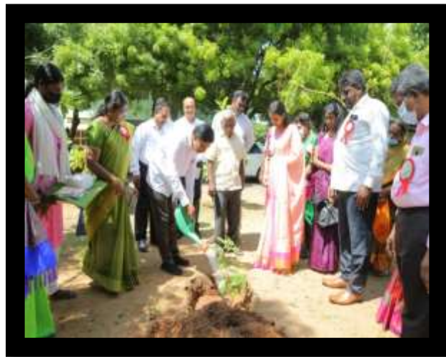
Planting of Sapling by Dignitaries