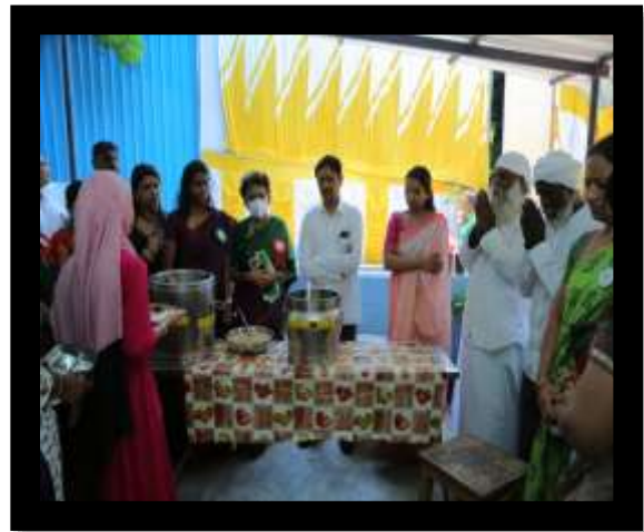
Inauguration of "Free Lunch Scheme" initiated by BGCWAA